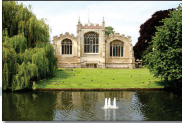
St Mary's church in the centre of Hitchin dates from the fifteenth century.