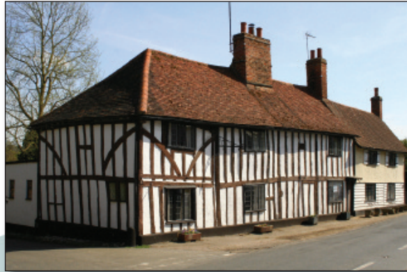
The classic half-timbering of a cottage in Much Hadham.