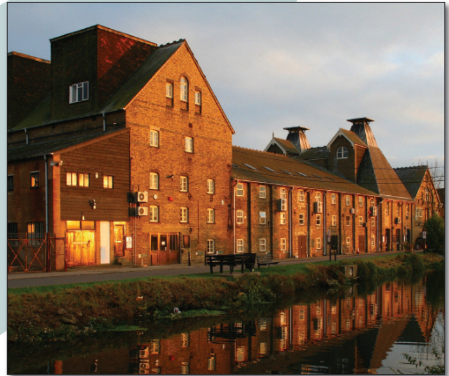
The golden evening sun bathes the old Sawbridgeworth maltings standing beside the River Stort, once a crucial part of Hertfordshire's brewing industry.