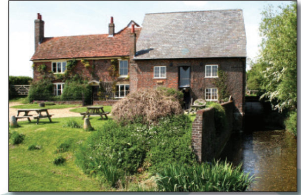
Redbournbury, one of the few surviving working mills in Hertfordshire.