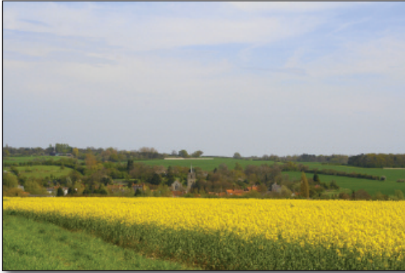
The village of Standon, bathed in the brightness of the afternoon sun, is seen nestling in the valley.